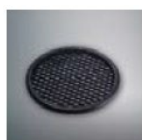
H7-1 Honeycomb louver