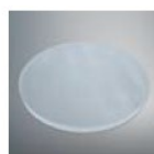
WG7-1 Woven glass