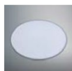
DS7-1 Diffusion sheet